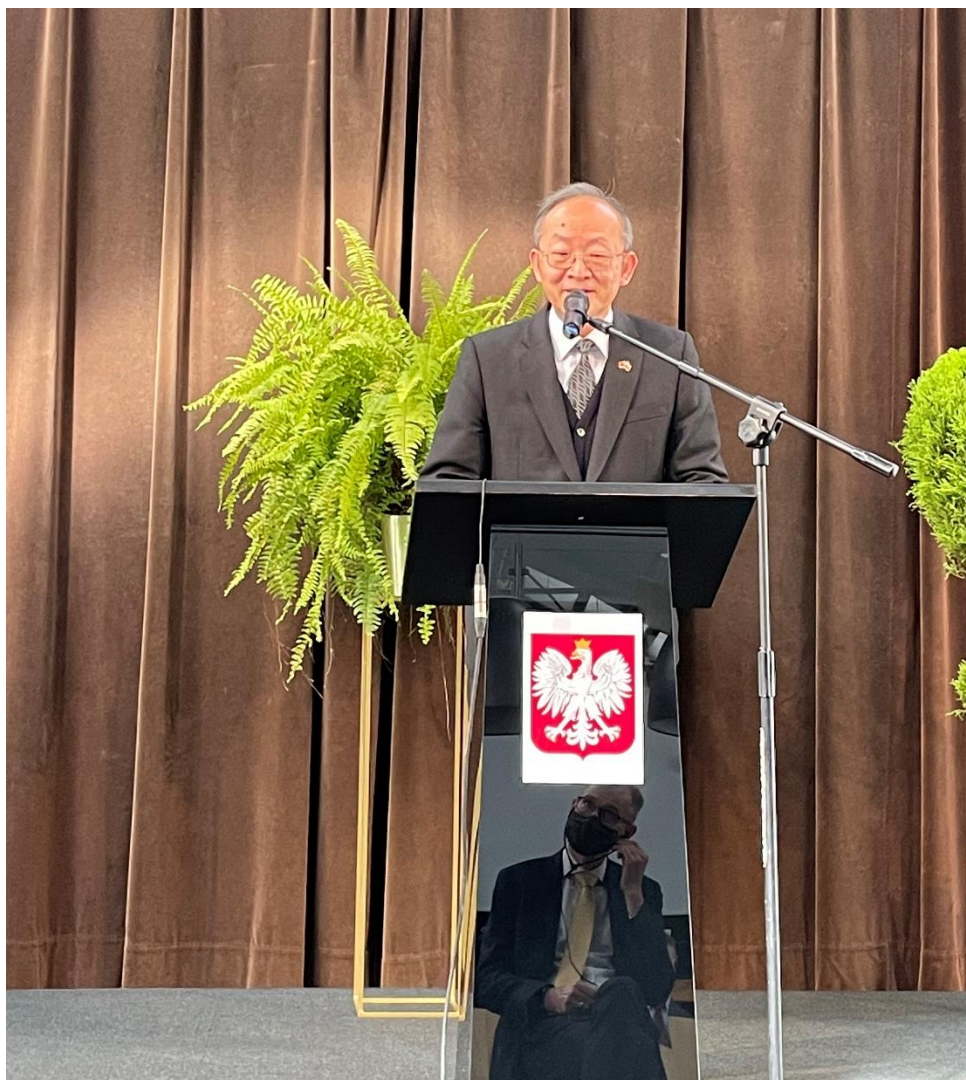
Figure 7 Launch Event presentation by the Ambassador Bob L.J. Chen of the Taipei Representative Office in Poland