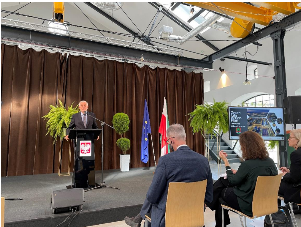
Figure 5 Launch Event opening presentation by the Mayor of Wałbrzych Roman Szełemej