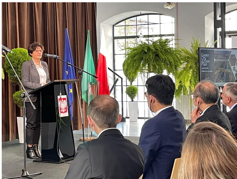
Figure 10 Launch Event presentation by Justyna Glusman vice-Mayor of Warsaw