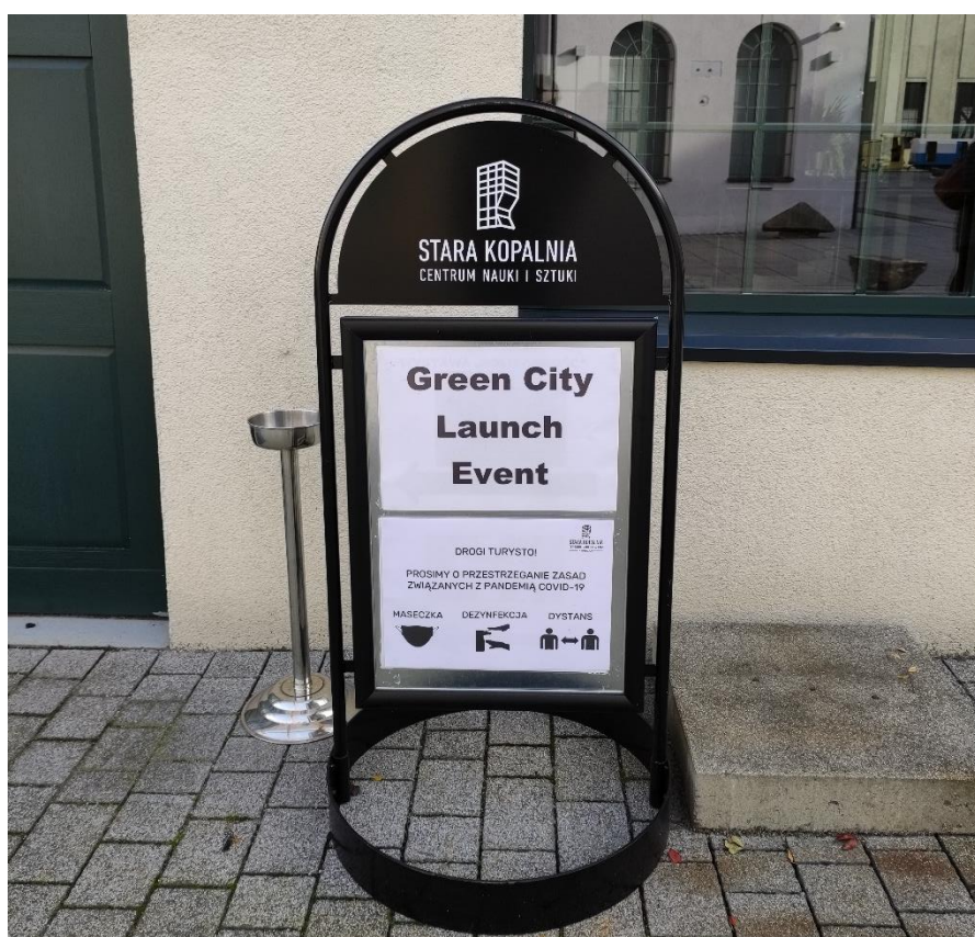
Figure 3 Launch Event entrance