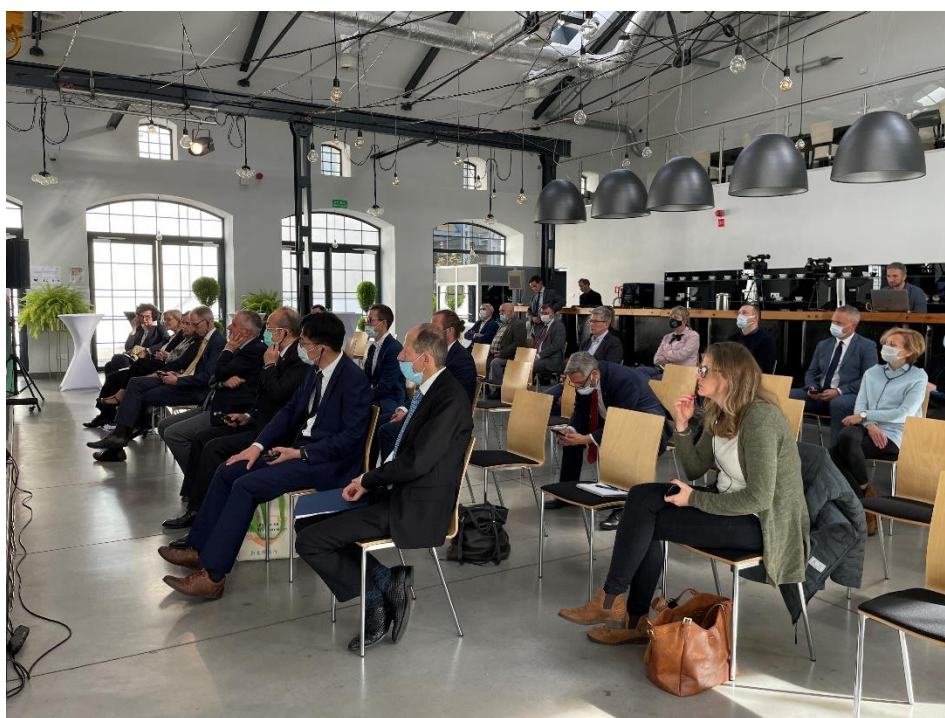
Figure 11 Launch Event