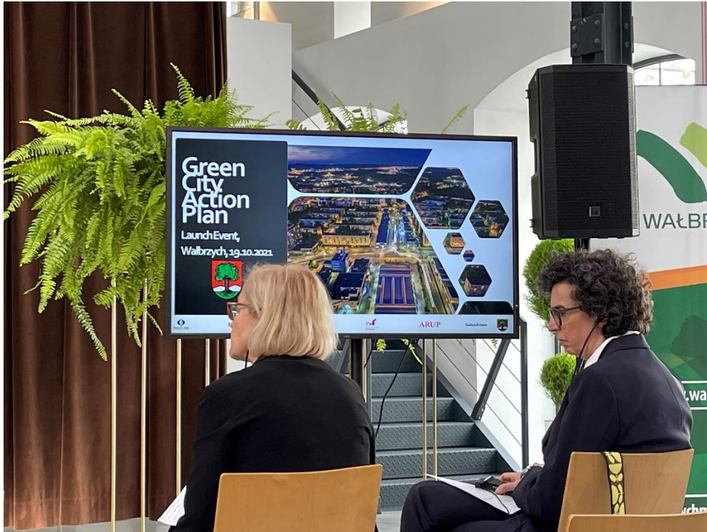
Figure 6 Launch Event