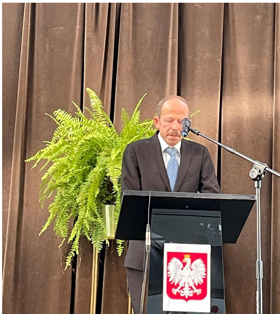
Figure 8 Launch Event presentation by Grzegorz Wasilewski Counsellor of the Ministry of Finance of the Republic of Poland