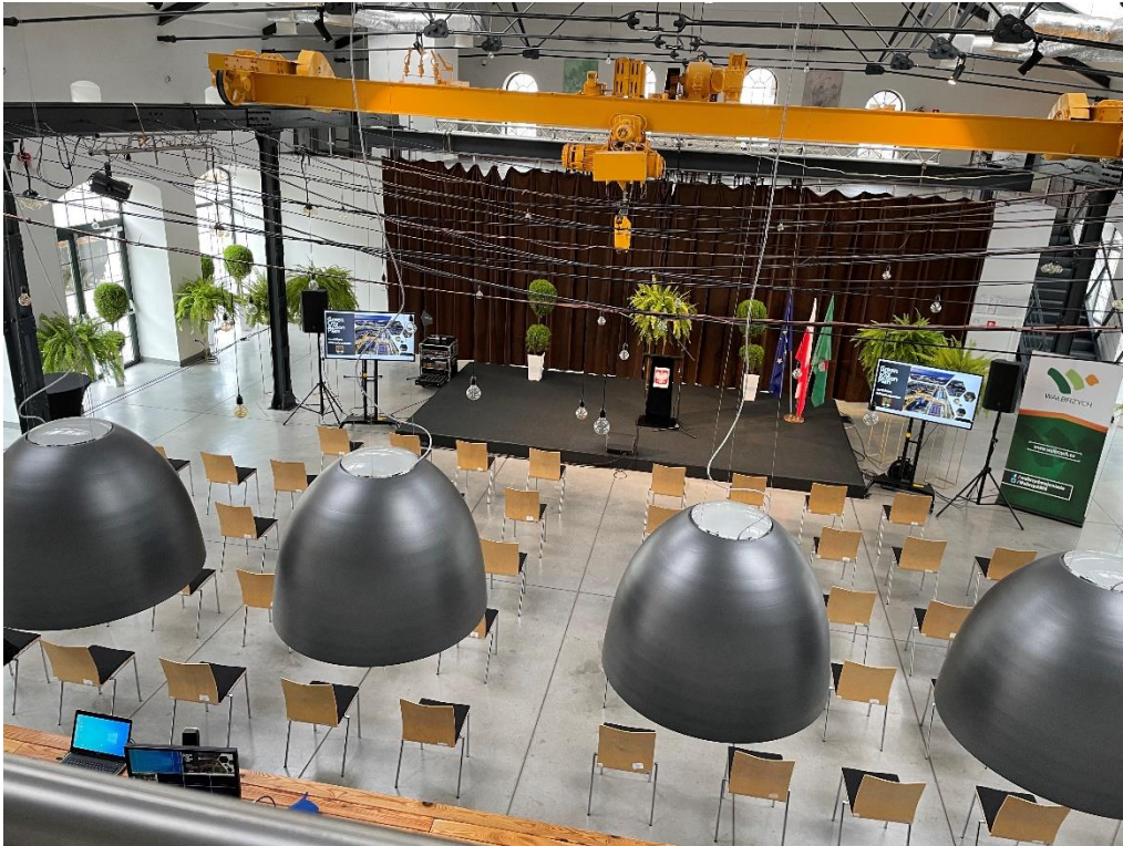
Figure 4 Launch Event venue